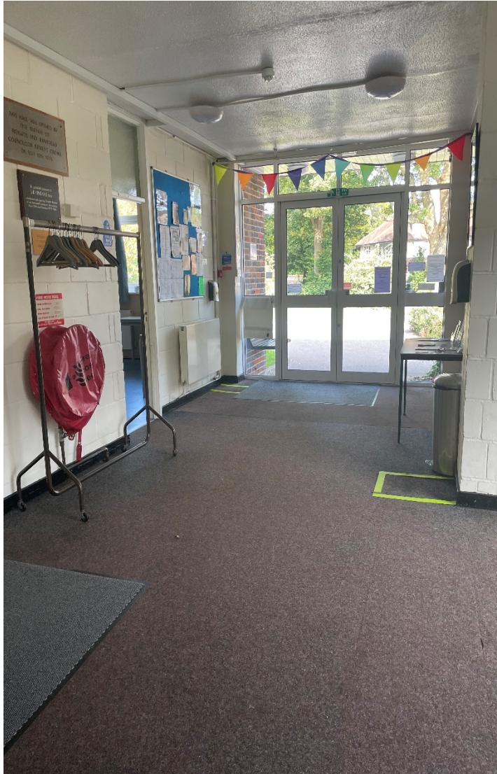
Main entrance into lobby area

Show internal areas of the building, excluding the actual polling station where voting will take place, including corridors that link to the polling station, kitchen and toilets, and highlight any possible signage requirements and potential hazards. Also indicate door swing direction and ease of opening, any areas of poor lighting, and any areas of uneven floor, etc.