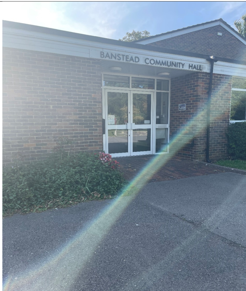
Main Entrance into lobby and building close up of double door access.